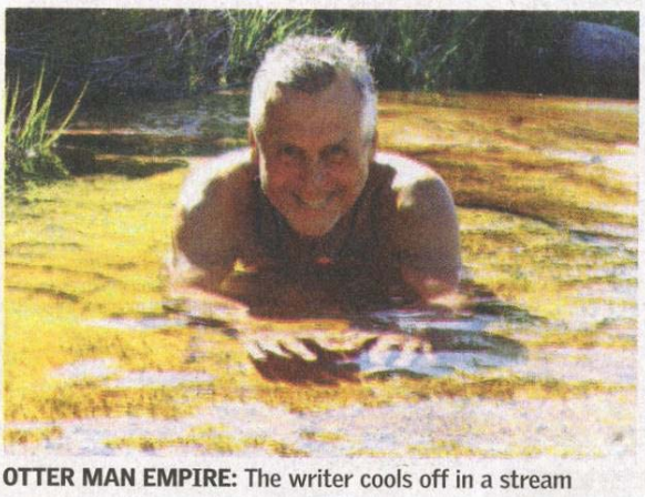
OTTER MAN EMPIRE: The writer cools off in a stream